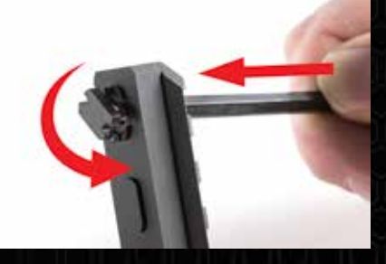
Spring-loaded screws for easy installation. Just push and turn 90 degrees.