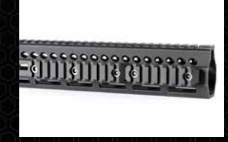
Fully stackable end-to-end. No more unwanted gaps.