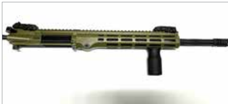
Upper Receiver Assembly