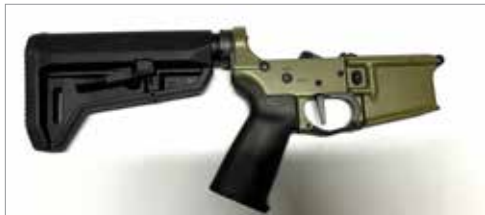
Lower Receiver Assembly